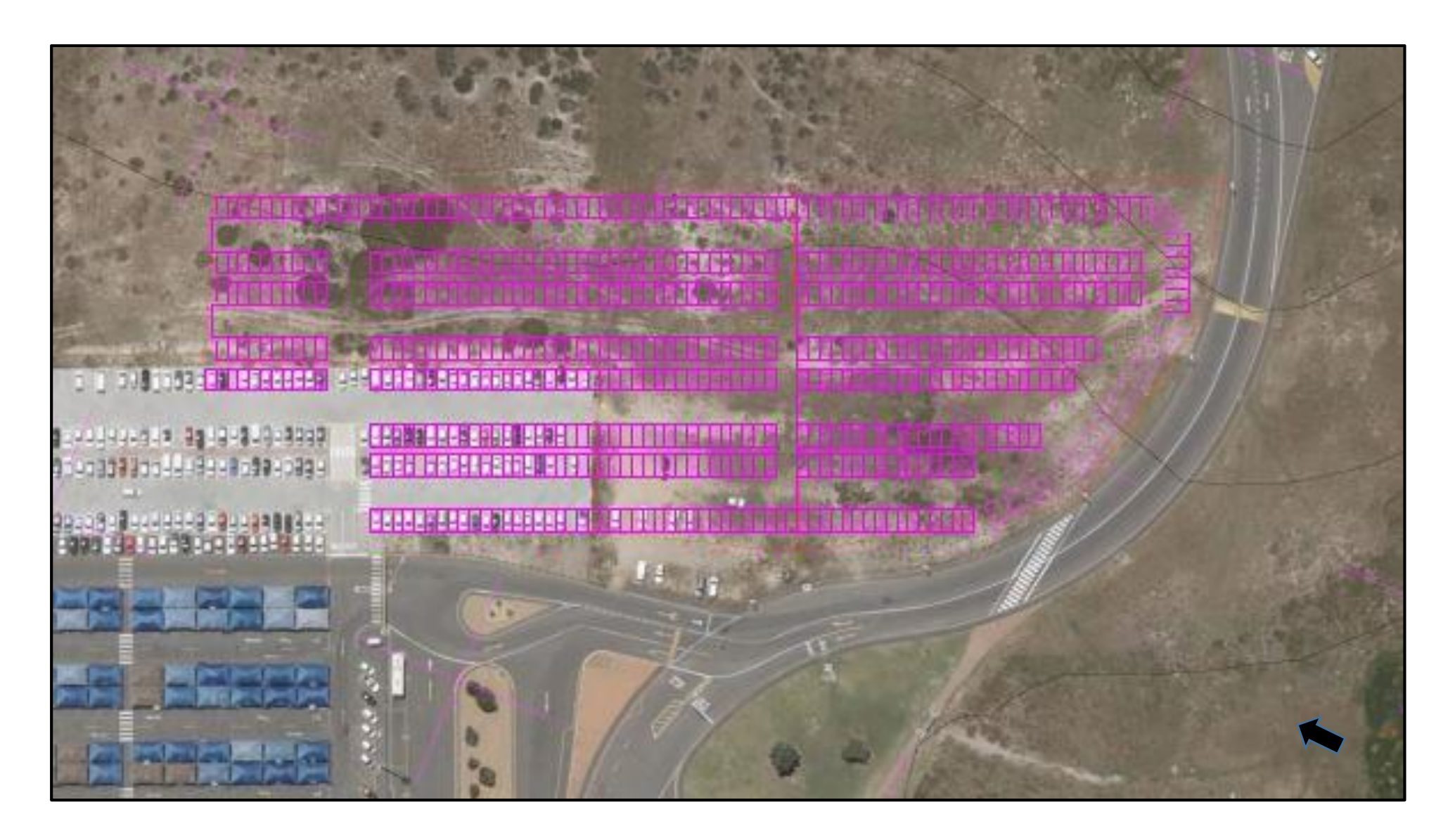
Figure 2. Rotated aerial image with overlay of the proposed parking extension (Worley Parsons, May 2016).