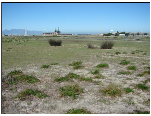
Figure 7. South-facing view from waypoint 005 (33° 40' 29.27" S; 18° 26' 13.98" E) with three plants of thatching reed ( Thamnochortus spicigerus ).