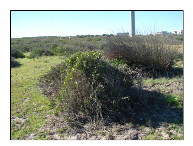
Figure 9. View of the vegetation outside the eastern boundary at waypoint 003 (33°40'27.23"S; 18°26'14.39"E) with gradual transition from highly degraded to shrubby semi-intact vegetation which grades into good quality ecologically intact vegetation.