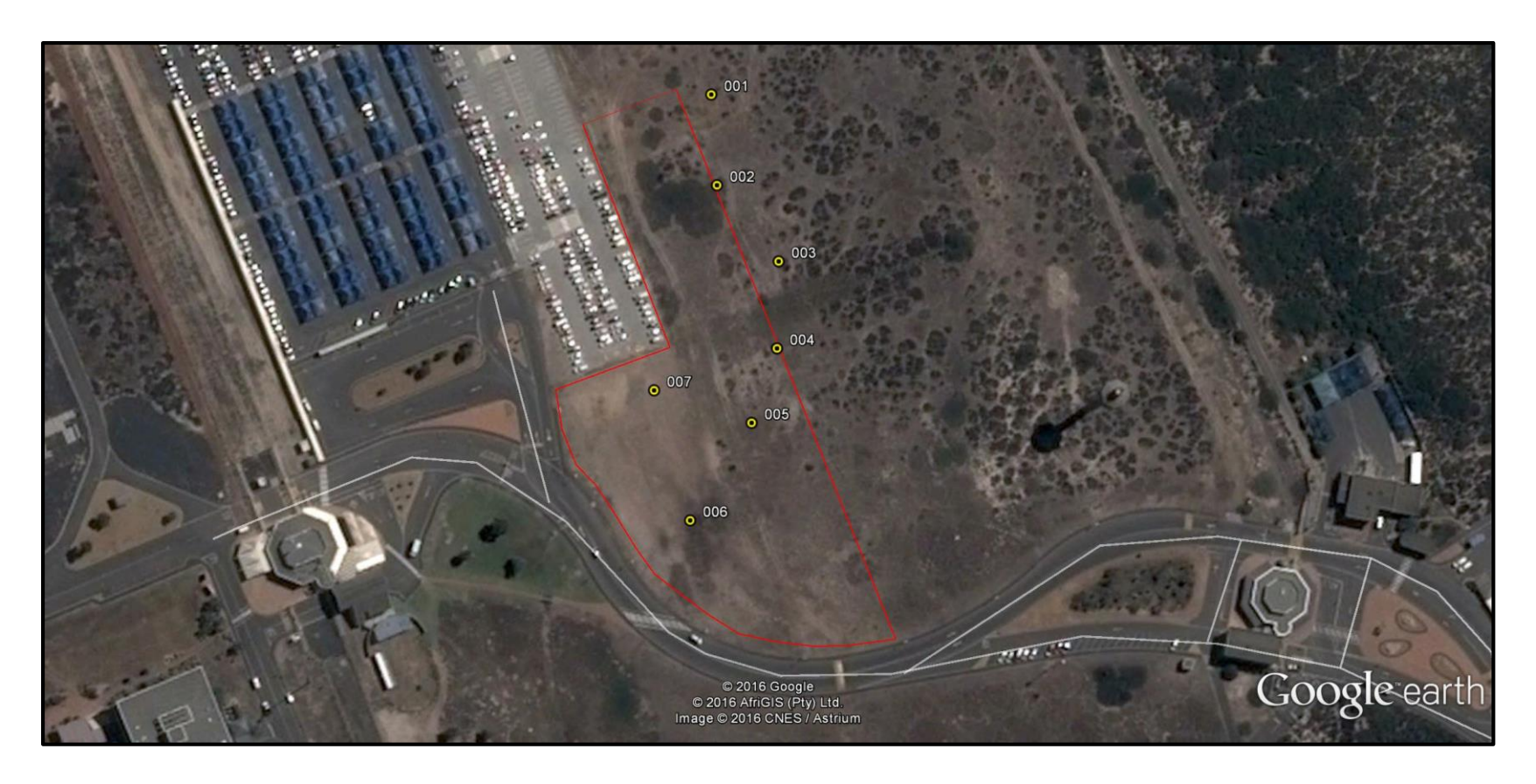
Figure 10. Google Earth<sup>™</sup> aerial image showing the proposed parking extension (red outline) with sample waypoints (numbered yellow circle icons).