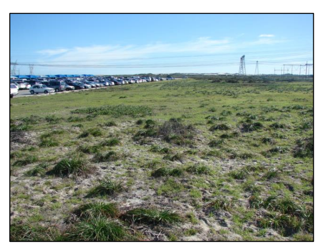
Figure 6. North-facing view from waypoint 005 (33° 40′ 29.27″ S; 18° 26′ 13.98″ E) showing the altered landscape that would have been defined by parabolic dunes prior to development of the KNPS.