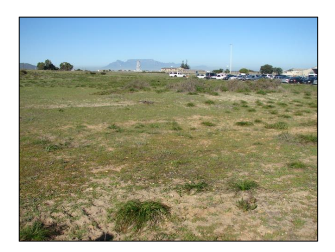
Figure 5. Highly degraded vegetation at waypoint 001 (33°40' 25.13" S; 18° 26' 13.37" E). The dark green tufted plants in the foreground is the natural pioneer species, duinekool ( Trachyandra divaricata ).

The ecological condition of the vegetation gradually improves from the eastern boundary of the site eastwards. The most abundant species include: Bromus cf. diandrus (exotic weed), turknael ( Erodium moschatum ) (exotic weed), small mallow ( Malva parviflora ) (exotic weed), and cf. Emex australis ( Kaapse dubbeltjie ) (exotic weed). Additional indigenous species include skaapbostee ( Otholobium bracteolatum ), goose daisy ( Cotula turbinata ), wild cineraria ( Senecio elegans ) and geelgifbos ( Senecio burchelli ).