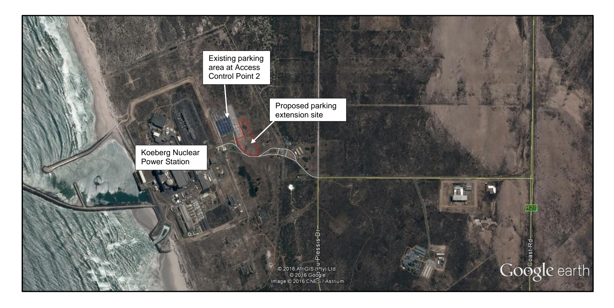
Figure 1. Locality map (Google Earth ™) showing the proposed site (red outline) in relation to the Koeberg Nuclear Power Station and the existing parking area.