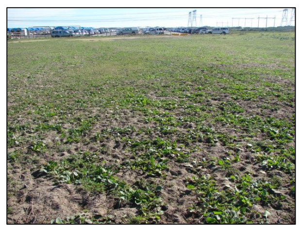
Figure 8. Transformed south-western corner at waypoint 007 (33°40'28.86"S; 18°26'12.50"E) dominated by a weed resembling Kaapse dubbeltjie ( Emex australis ).